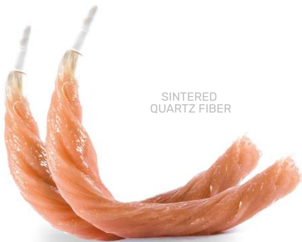
SINTERED QUARTZ FIBER

QUARTZ fiber is a revolutionary material for dental technicians, specifically designed for implant rehabilitation. It is a composite reinforced with the highest quality quartz fibres designed to offer the best resistance to the core of your product and impeccable aesthetics with a total reduction in processing time .